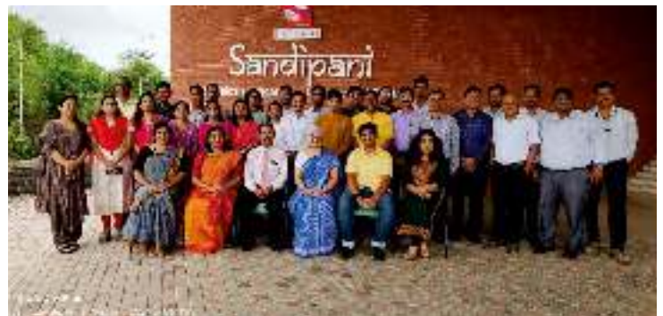
MSFDA Batch 10: 6 days (Residential) at Symbiosis International (Deemed University)