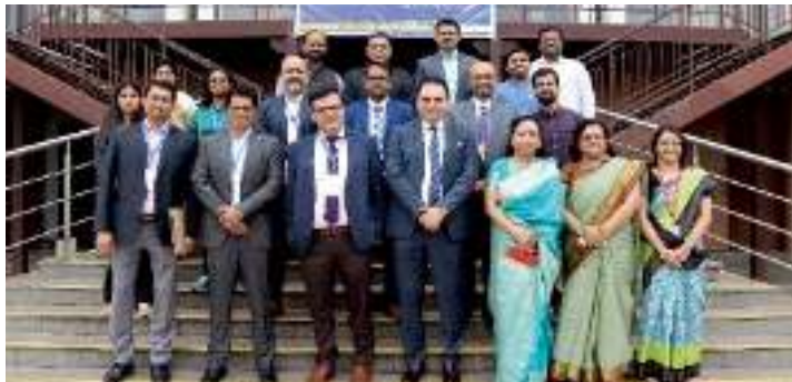
Symposium 2024: "Innovations in Financial Planning Services: Trends and Their Implications" at SSBF on 21 st September 2024