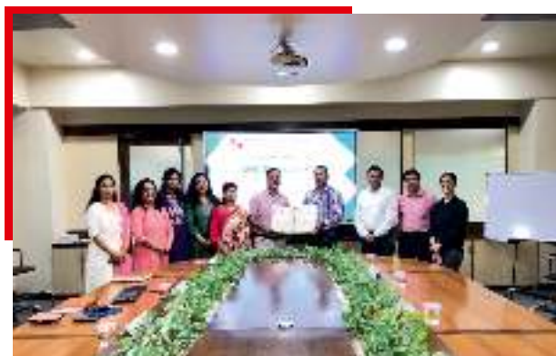
MoU signing with Dendrite.ai LLC