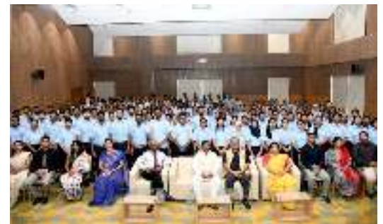
Induction of XLVI Batch of PGDEMS Programme at SCHS Pune