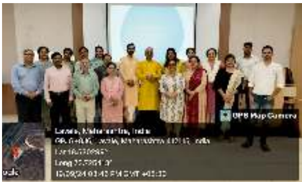
FDP on Understanding Indian Knowledge System (19 th & 20 th September 2024) at Sandipani

Symbiosis Teaching Learning Resource Centre (STLRC) has conducted 21 FDPs in the month of July, August and September 2024. Faculty Development Program on TAAL - 'Techno- pedagogy and Andragogy for Active Learning' organised by Maharashtra State Faculty Development Academy (MSFDA) from July 2024 from 1 st to 6 th .