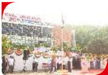
SIU, Lavale campus