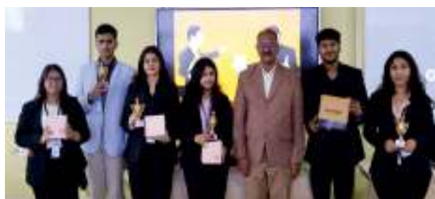
Anveshan 2024, SCMS, Bengaluru

Anveshan 2024: The Research Committee of Symbiosis Centre for Management Studies (SCMS), Bengaluru organised Anveshan 2024. With fiery debates on the Budget 2024, participants showcased unmatched zeal and insight, discussing its impact on our nation's future on the 26 th August 2024.