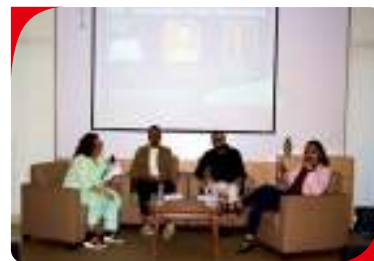
World Entrepreneurs' Day at SIDTM