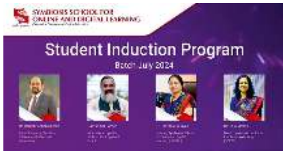
Series of Sessions from (SSODL)

Series of Sessions on Career Development: Introduction to Group Discussions (GD) and Interview Processes. Symbiosis School For Online and Digital Learning (SSODL) conducted an orientation session and an open house with students of all batches and programmes to address their queries and grievances. The student induction programme was conducted online with the entire community of July 2024, batch of M.B.A. B.B.A. M.Sc. Data Science, M.Sc. Computer Application, M.Sc. & B.Sc. Economics & M.A. Mass Communication.