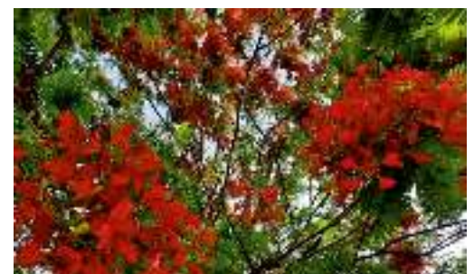
A flowering Gulmohar Tree

Campus Phenology Network: Students of the Biodiversity Club participated in the Campus Phenology Network, a nationwide initiative by SEASONWATCH, in which individual trees are monitored for their flowering and fruiting patterns all throughout the year. Each student has been monitoring at least 5 th trees on campus since the beginning of the program in April 2024.