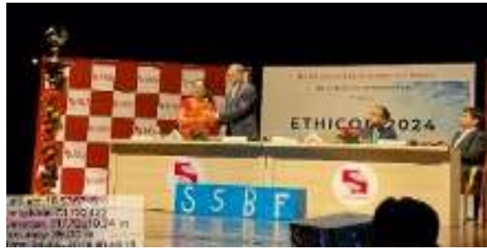
SSBF hosted Ethicon 2024, organized by the Corporate Interface Team on 24 th August 2024