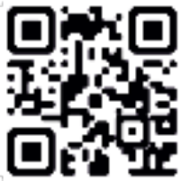
Symbiosis Central Alumni Portal