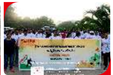
Fitness for Freedom Run SIBM, Bengaluru