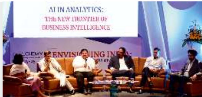
Alchemy 2024: The 12 th Annual Management Conclave of SIBM, Bengaluru, was held on 13 th -14 th September 2024. Themed "Envisioning India: Shaping the Companies of Tomorrow".