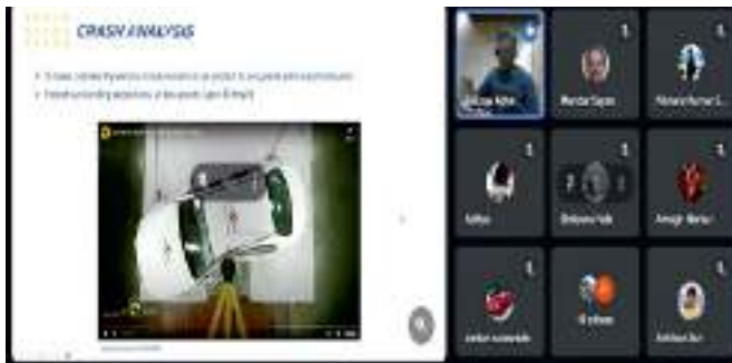
Crash Analysis of Automobiles Session at SIT Pune