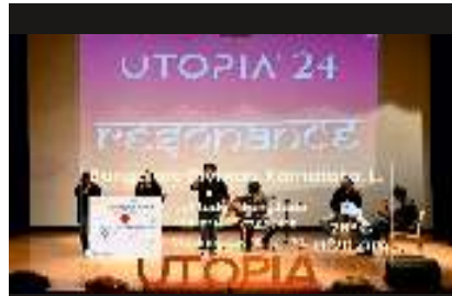
SIBM Bengaluru celebrated the essence of "Ekavram" at Utopia'24 on 31 st July 2024