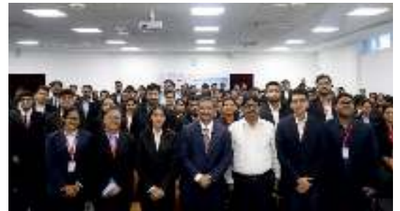
14 th Foundation Day of SSBF