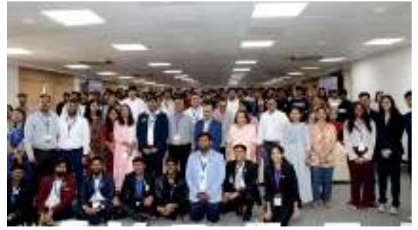
SIT, Pune team