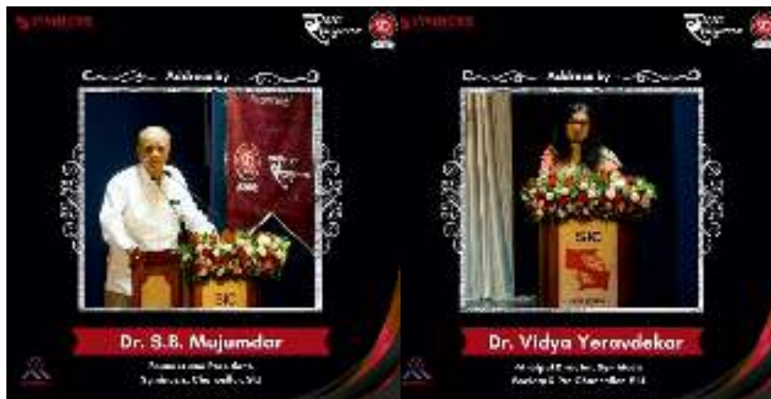
Silver Jubilee Celebration of SCIT