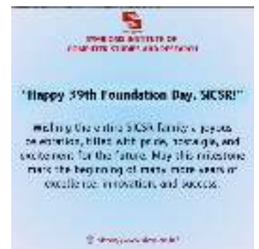
39 th Foundation Day of SICSR