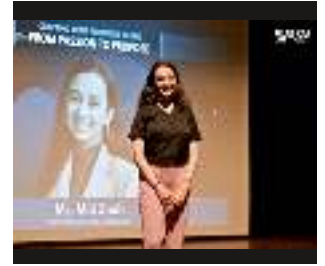
Propelx conducted by iSMART council on 25 th July 2024 by SIBM Pune