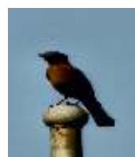
Brown Rock Chat, a nesting species in our region