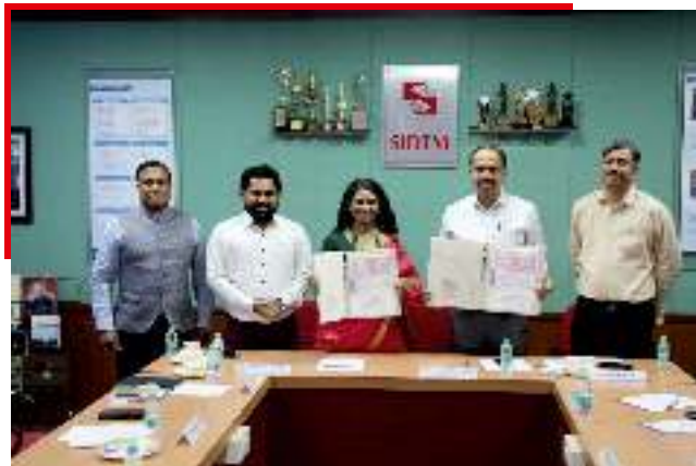
MoU signing with Blackbucks Education Private Limited