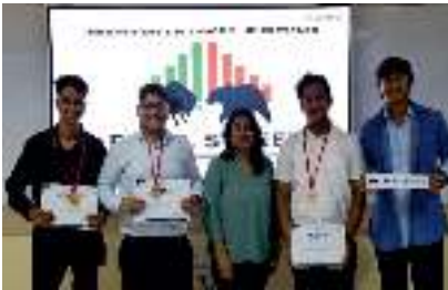
A Mock stock trading competition at SCMS, Bengaluru on 27 th August 2024