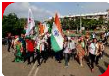
Leadership Walk Lavale Campus