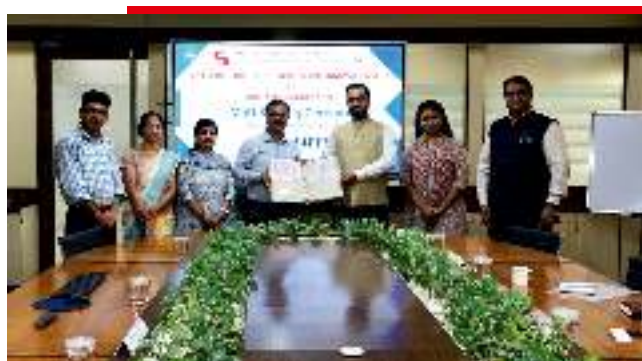
MoU signing with ARAI - Advance Mobility Transformation & Innovation Foundation (AMTIF)