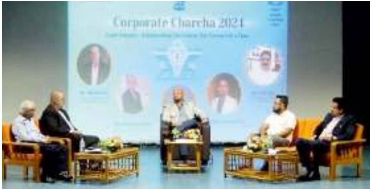
Panel Discussion in Corporate Charcha 2024

Induction and Orientation for the B.Sc. (Sports and Exercise Science): The induction and orientation program for the B.Sc. Sports and Exercise Science degree (Batch 2024-28) at Symbiosis School of Sports Sciences (SSSS), concluded on the 6 th July 2024. The event aimed to introduce students to the course structure, faculty, facilities, and resources available to support their academic journey.