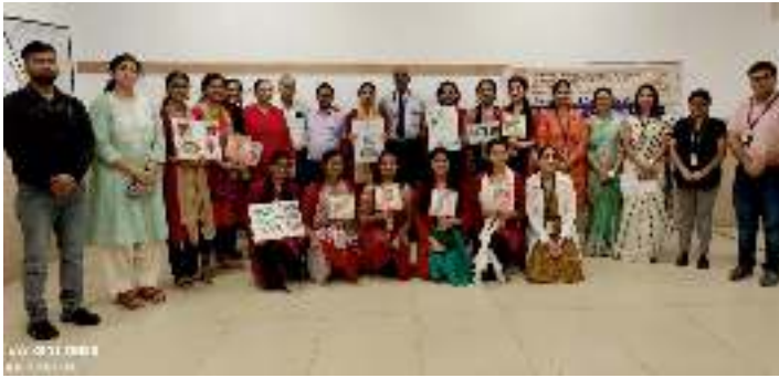
Indian Organ Donation Day - Awareness Activity by SUHRC