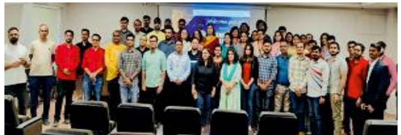
The Department of AI and Machine Learning, SIT, Pune successfully hosted the Generative AI Meetup on 24 th August, 2024.