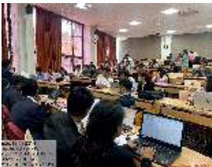
THE BIG BAD BULLS: Equity Research Cell of SSBF hosted a thrilling live trading event on 9 th Sept 2024