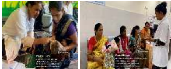
SCOPE, Nurse participation in VHND Session

Village Health and Nutrition Day : Village Health and Nutrition Days (VHND) are carried out in the villages of Mulshi block every month by Govt. health functionaries and SCOPE. All eligible children and ANCs are given vaccines against preventable diseases. ANCs and PNCs learn about concerned preventive and promotive aspects of healthcare along with the importance of Breastfeeding and Vaccination for expecting child.