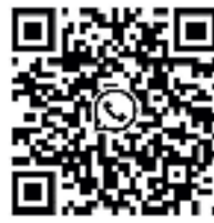
Reach out to SCAE on WhatsApp