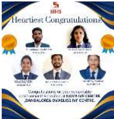
StudentS from SIHS

M.Sc. (ART&E) students from SIHS (Batch 2023-25) have successfully secured the position of Trainee Embryologist at NOVA IVF centre, Bangalore & OVABLISS IVF Centre, Pune.