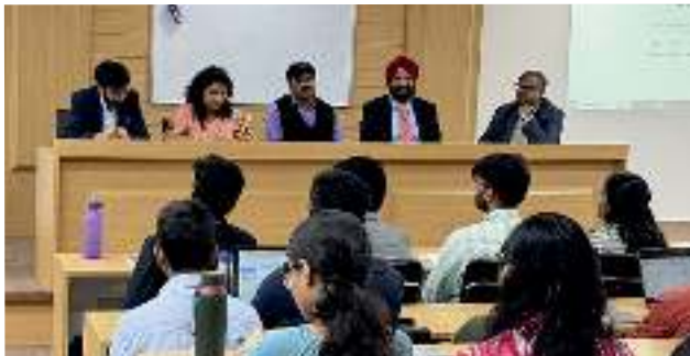
Budget Symposium 2024 at SIBM Nagpur