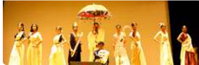
Onam celebration at SLS Hyderabad