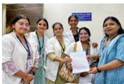
Students from SIHS, at the internship program

Third year students of B.Sc. Mental Health from Symbiosis Institute of Health Sciences (SIHS) embarked on a transformative journey through a three-week internship program. These students had the privilege of interning at some of the most prestigious institutions in the mental health field, including NIMHANS, Yerawada Mental Health Hospital, Cooper Hospital, Child and Adolescent Learning Centre, Neuropsychiatric and Rehabilitation Centre Career Counseling Startups.