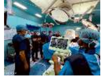
Endoscopic Spine Workshop by SUHRC