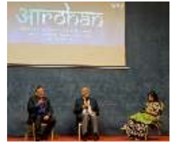
Aarohan: Conference by SGC on 13 th August 2024