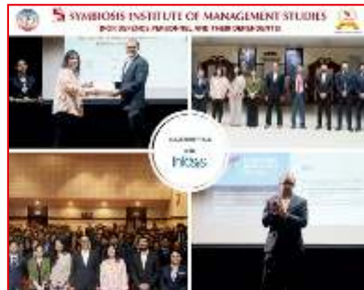
Leadership talk Series