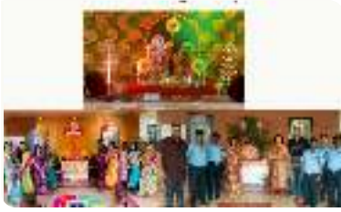
Ganesh Festival at SCMS, Pune