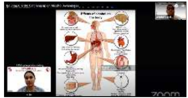
Webinar conducted by SCEW

Pouring Clarity: Catching up on Alcohol Awareness - A webinar was conducted by Symbiosis Centre for Emotional Wellbeing (SCEW) on the 5 th of July 2024, observing alcohol awareness week which delved into topics such as alcohol harm, signs of misuse and distinguishing between moderate and harmful alcohol use.