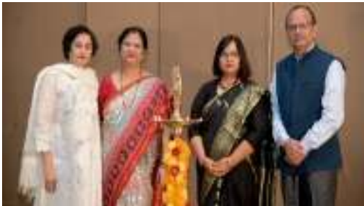
32 nd Foundation Day of SIIB