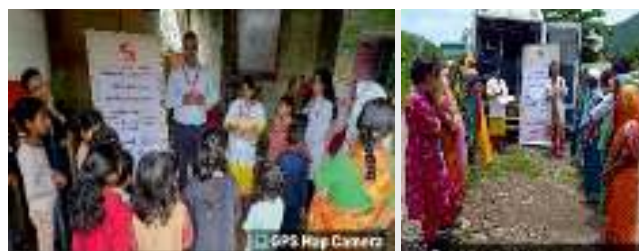
Medical Officer with Nurses and MSW's conduction Awareness Sessions

Awareness Session on Health Promotion Activities: SCOPE has implemented health education activities to increase health awareness in the areas of nutrition, maternal and child health, infectious diseases, non-communicable diseases, vector-borne diseases, alcohol and tobacco deaddiction, deworming, and organ donation, etc.