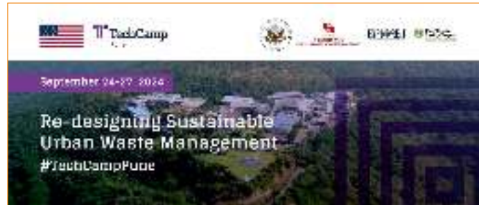
The TechCamp 2024 - "Re-Designing Sustainable Urban Waste Management by SCWRM