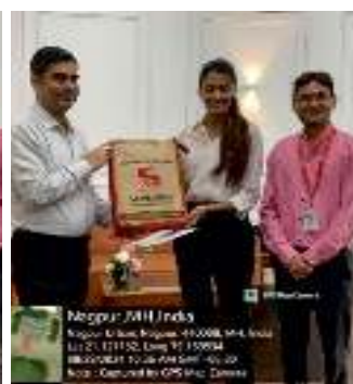
Students from SCMS , Nagpur, receiving the Award