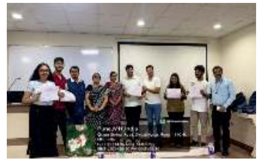
SICSR, conducted Internal Hackathon Round for SIH-2024 held from 30 th & 31 st August 2024, in a hybrid mode.