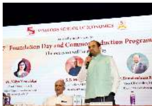
Common Induction and Foundation Day at SSE