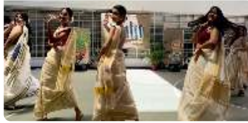
Armaadham '24 : Onam celebration at SSLA