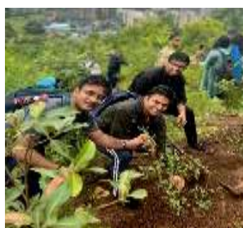
At SCIT on 24 th August, 2024