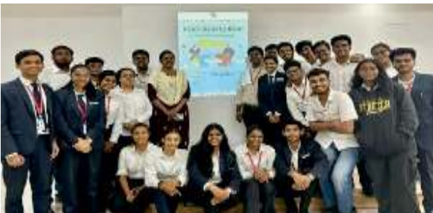
Innovation Genesis : The event enhanced problem-solving skills and tech vocabulary with interactive activities at SIT, Nagpur