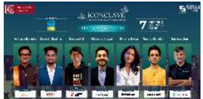
iConclave (Engaging Minds | Empowering success) was organized by Innovation Council Team at SIBM, Pune on 25 th August 2024.