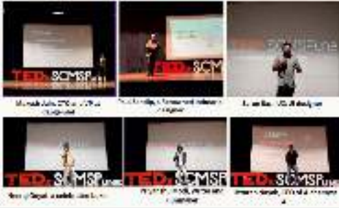
TEDx SCMS, Pune