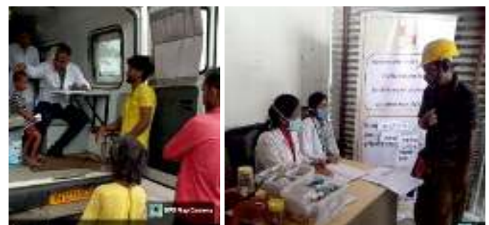
Health Check Ups

Community Camps : The health care unit organizes on-site general health check-up camps at identified sites (brick kilns, construction sites). The identified high-risk cases are referred to Symbiosis University Hospital and Research Centre (SUHRC), for further investigations and treatment which is free of charge to the patients.