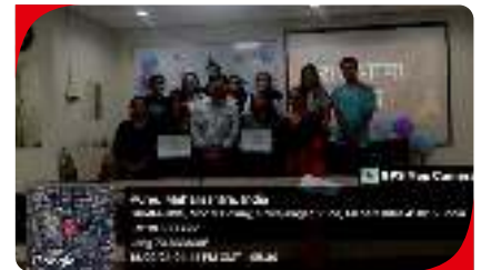
"Hindi Diwas" at SICSR