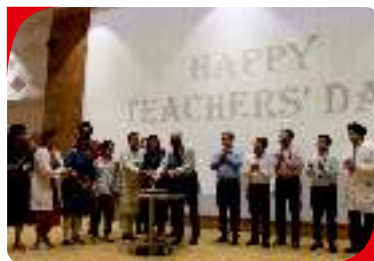
Teacher's Day at SMCW & SUHRC