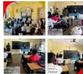
International Literacy Day at SSBF