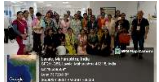
Symbiscope 2024: SUHRC, and SMCW hosted the inaugural event of Symbiscope 2024, a series of workshops