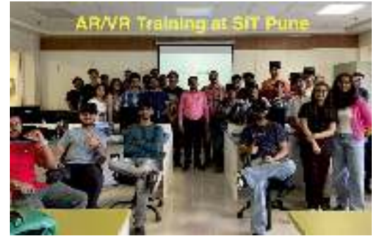
Department of Robotics & Automation, SIT, Pune, conducted 6 -day training program on Augmented Reality (AR) and Virtual Reality (VR) technology