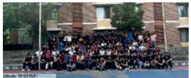
Ice-Breakers Event by SSBF

Ice-Breakers 5.0: 10 th July 2024: The Sports Committee of Symbiosis School of Banking and Finance, (SSBF) organised the fun event – Ice Breakers on 10 th July 2024. The events' main intention was to help the junior and the senior batch interact with each other and to indeed break the ice between them and feel more relaxed with each other.