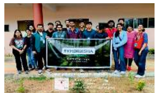
Symbriksha at SIBM, Bengaluru on 31 st July 2024