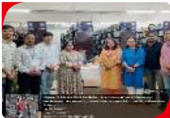
The Librarian Day at SIOM