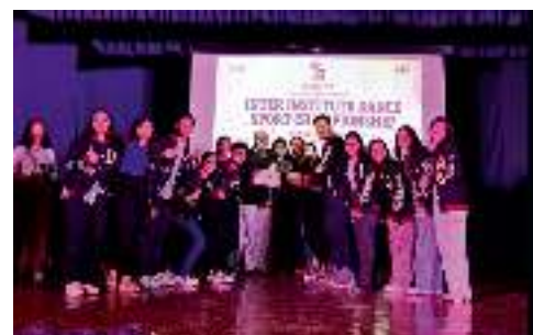
Winners of Dance Competition