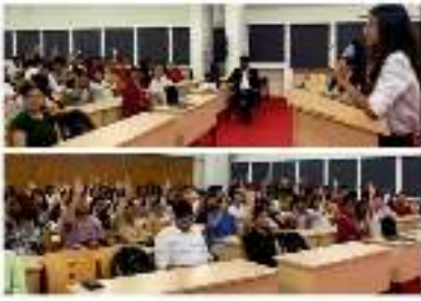
Moot Orientation Program for Batch 2024 at SLS, Hyderabad