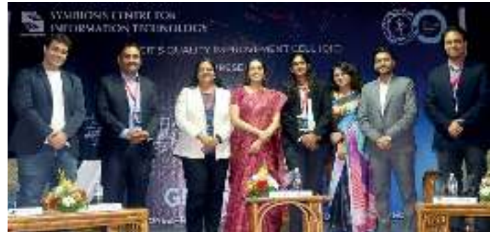
The National Seminar at SCIT to explore IT and related industries