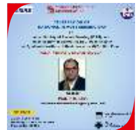
National Remote Sensing Day at SIG