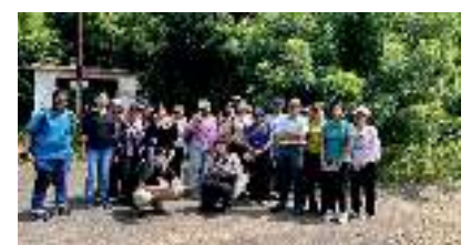
Students during the field visit