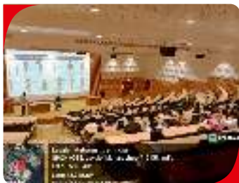
World Physiotherapy Day by the Physiotherapy Department of SMCW and SUHRC