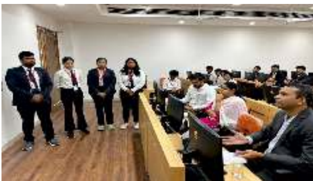
AICTE Smart India Internal Hackathon, SIT, Nagpur

AICTE Smart India Internal Hackathon: Symbiosis Institute of Technology (SIT), Nagpur, hosted the Smart India Internal Hackathon, featuring 95 dynamic teams with ground breaking ideas. Congratulations to the top 36 teams who impressed our esteemed judges with their standout projects.