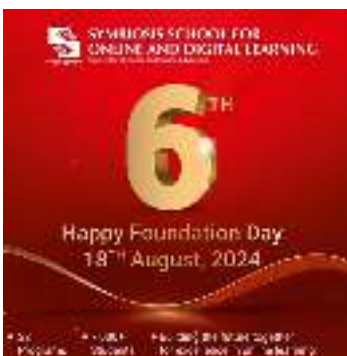
6 th Foundation Day Celebration of SSODL