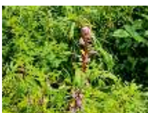
Balsam plant at the wetlands on Lavale campus fresh shoots

Nature Trails: The Symbiosis Centre for Climate Change and Sustainability (SCCS) conducted various nature trails for the students of SSIS, SIHS, SSBS, and SIT as a part of the campus biodiversity club. About 50+ species of birds were recorded this season, and species such as the Vigor's Sunbird, Cinnamon Bittern and Brahminy Kite were recorded in our campus for the first time ever.