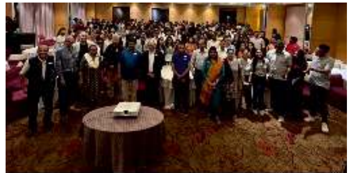
Encore South 2024: Alumni Meet of SIBM, Pune, was held at Bengaluru on 21 st September 2024.