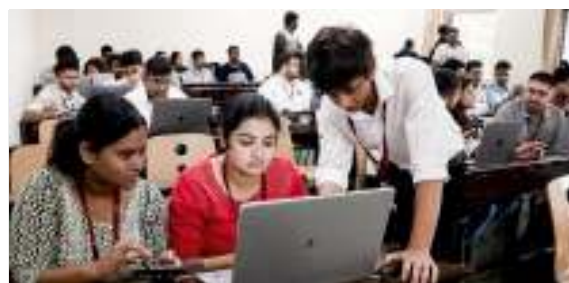
The Ultimate Bizz Mind event at SIIB

The Ultimate Bizz Mind : In the spirit of innovation and ambition, the E-Cell at SIIB organized an event “The Ultimate Bizz Mind”, for Batch 2024-26 on 21 st August 2024. This vibrant platform served as a hub for creativity, igniting and fueling the entrepreneurial spirit. Participants enthusiastically engaged in the competition, exploring the intricate process of transforming ideas into impactful ventures.