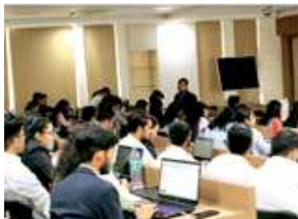
Lean Six Sigma training by Grant Thornton at SIBM, Noida