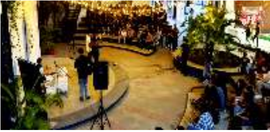
SAMAAGAM'24: Annual alumni reunion of SIBM, Bengaluru bringing together graduates across all batches.