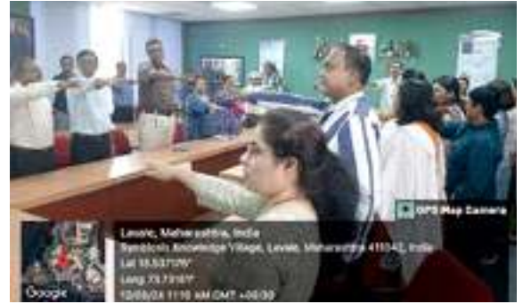
Nasha Mukta Bharat Abhiyaan Pledge against Drug Abuse at SIDTM