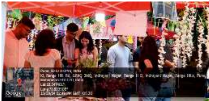
SIMS, Pune hosted "Market Beat 2024" with a meme-themed carnival on 15 th September 2024