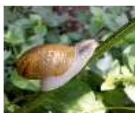
Snail feeding on the fresh shoots