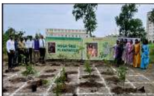
At SCSD on 31 st July 2024

Tree Plantation Drives: Tree Plantation was conducted across institutes of SIU