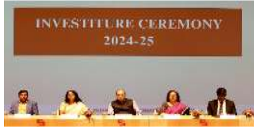
The Investiture Ceremony for the Student Advisory Board (SAB) 2024-25 of Symbiosis Law School, Pune took place on 18 th September 2024