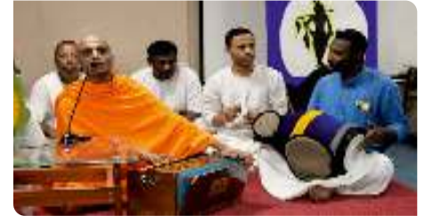
Janmashtami Celebration at SLS, Pune