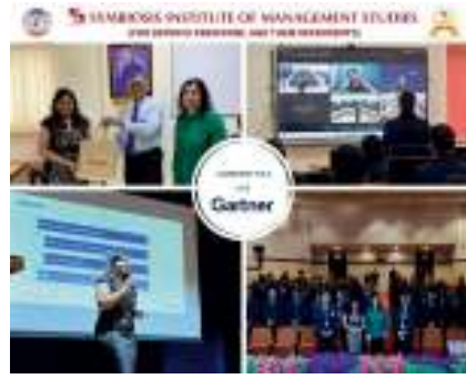
Leadership Talk with Gartner at Symbiosis Institute of Management Studies (SIMS), Pune, (Batches 2010-14) of SIBM, Bengaluru