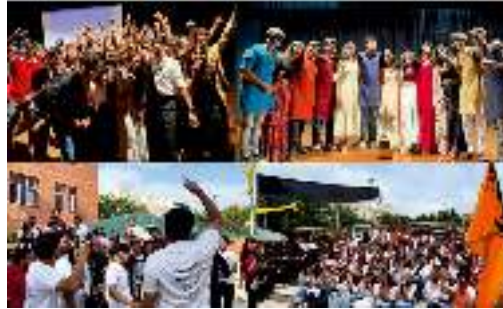
Cult Nights 2024-25: A Celebration of Culture and Creativity at SCMS, Pune