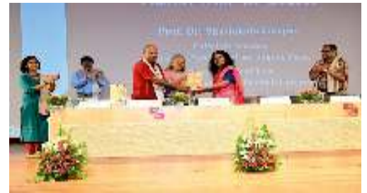
Aurobindo International Youth Conference at SLS Pune

Aurobindo International Youth Conference: The Sri Aurobindo International Youth Conference, Pune Chapter, was held on 6 th August 2024, at Symbiosis Law School (SLS), Pune in collaboration with the Auroville Society. The conference focused on Sri Aurobindo's life, philosophy, and contributions to politics, spirituality, and education, emphasizing his legacy for youth and global consciousness.