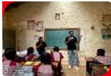
International Youth Day at SSBF