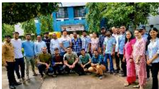
Cloth donation drive conducted by SIOM

Cloth donation drive conducted by SIOM : Spandan, the CSR wing of Symbiosis Institute of Operations Management (SIOM), Nashik organized a cloth donation drive in collaboration with the National Association for the Blind (NAB), Nashik. This initiative aimed to provide essential clothing and other accessories to needy children. The collected items were donated on the 9 th of July, to NAB, our partner.