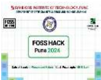
FOSSHack Pune 2024 : SIT, Pune hosted the event which provided a platform for students to innovate and showcase their skills