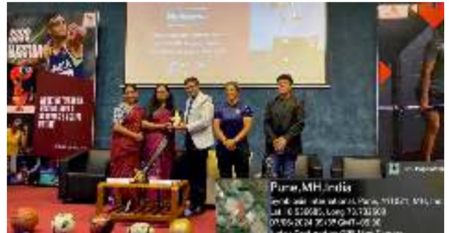
Guests being Felicited at the Induction

Induction and Orientation for the B.Sc. (Sports and Exercise Science): The induction and orientation program for the B.Sc. Sports and Exercise Science degree (Batch 2024-28) at Symbiosis School of Sports Sciences (SSSS), concluded on the 6 th July 2024. The event aimed to introduce students to the course structure, faculty, facilities, and resources available to support their academic journey.