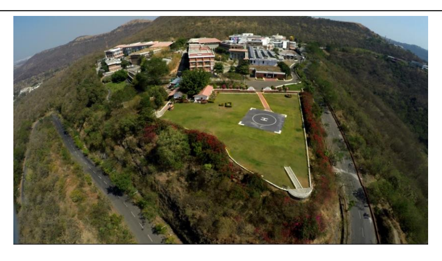
Lavale, Pune Campus