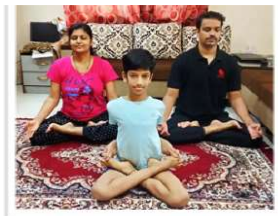
Symbiosis Staff performing Asana along with his family Asanas