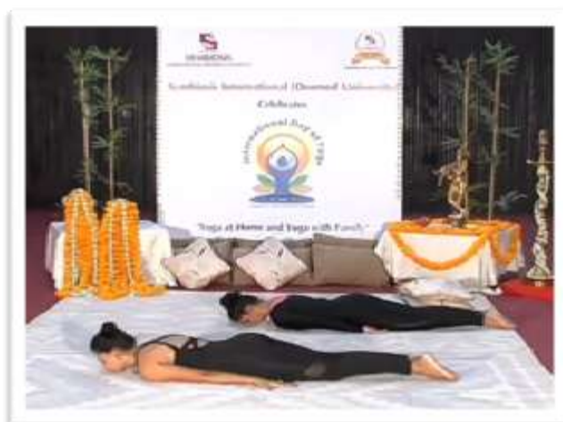
Experts performing Asanas