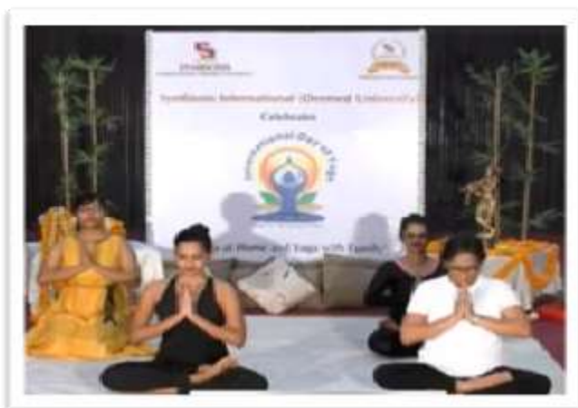
IDY 21 st JUNE (LAVALE HILL TOP)